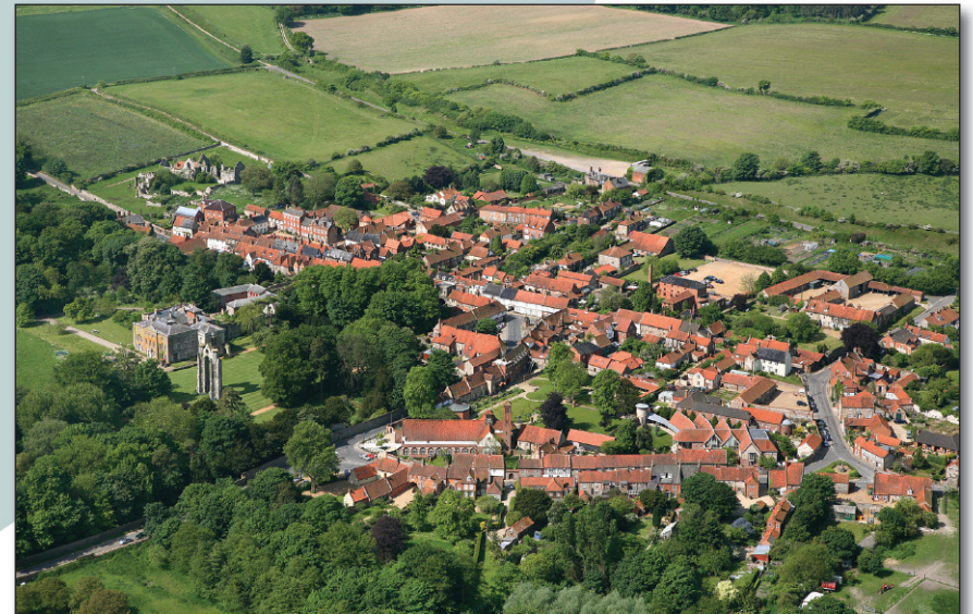
Walsingham. Many of the features of the historic and compact little town can be seen in this picture. Continuing with our railway theme though, the old line still marks the western extremity of the town, where the goods shed is the last building before we reach the fields at the top of the picture.