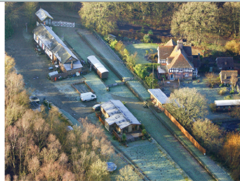
← Raynham Park The one feature obviously absent from this location fifty years after closure is the track. Most railway buildings, including the level crossing gate, have survived virtually unaltered; the nearest building and the coach on the platform are the only additions to the site.