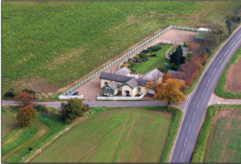
Piggs Grave. The railway ran diagonally from bottom left to top right past Gunthorpe gatehouse with its small cabin from which protecting signals were operated. It lies at the highest point on the M&GN system, known as Piggs' Grave summit.