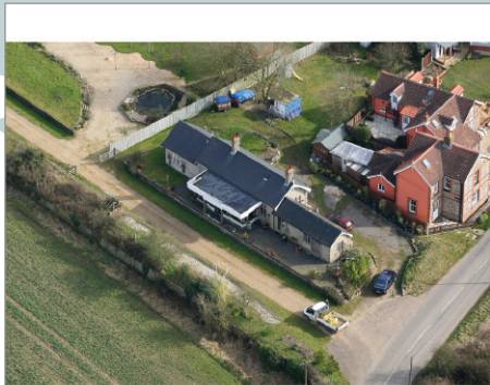
East Reedham → The station buildings, complete with slate roofs and typical barge boards on the gable ends, have received superb restoration. The new entrance at the north-eastern end is in keeping with the original design, even the awning, which is a recent addition, looks as though it has been there since steam-hauled trains chugged through.