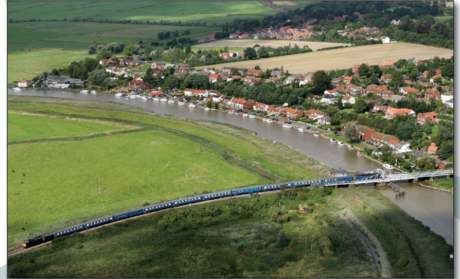
Reedham. The majority of the village, with its extensive river frontage, can be seen in the background as this special train negotiates the sharp curve on the south side of the swing bridge, heading for Lowestoft. There is also a sharp curve on the north side and the line on which the train had approached Reedham can be seen in the top centre of the view.