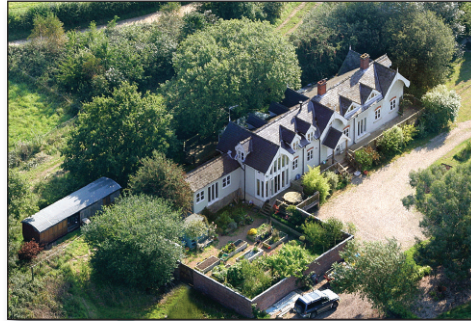
Hindolvestone. The old station building has been renovated and extended, displaying an abundance of gables and dormer windows.