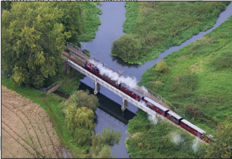
Buxton. A train from Wroxham crosses the River Bure as it approaches Buxton. The bridge has been adapted to carry both the railway and footpath over the river.