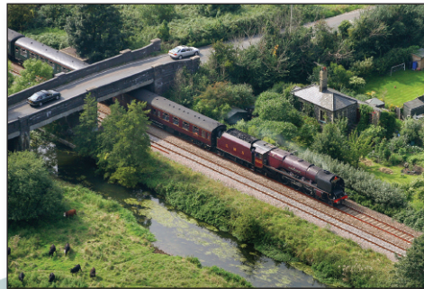
Lakenham. The railway is keeping company with the River Tas as "Duchess of Sutherland" passes under the Stoke Holy Cross Road.